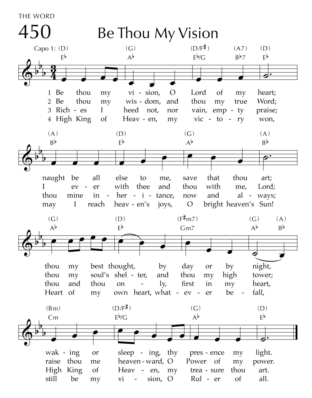
Guitar chords do not correspond with keyboard harmony.

These stanzas are selected from a 20th-century English poetic version of an Irish monastic prayer dating to the 10th century or before. They are set to an Irish folk melody that has proved popular and easily sung despite its lack of repetition and its wide range.