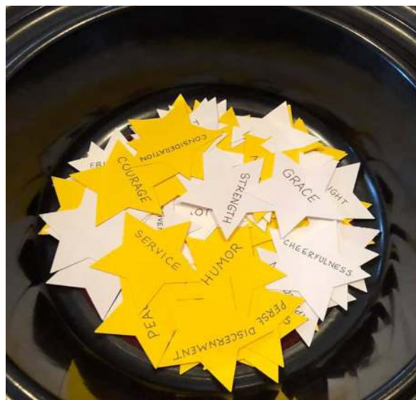
Image: Star Words at CPC.

If you missed worship on January 6, and would like a star-word, let us know. We would love to hear how your word is leading and guiding you. Throughout the year, we'll share our stories of how our word is leading us and "guiding" us to Christ, the perfect light. . ✚